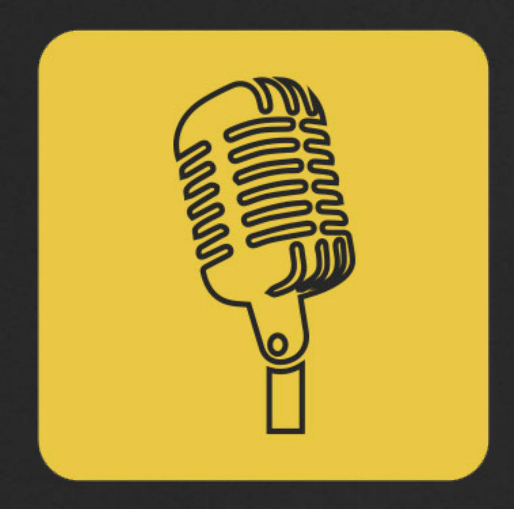
2+ WORSHIP TEAMS